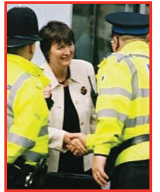
Meaningful consultation over PCSOs

Gedling's main shopping streets have 24hour recorded CCTV footage but operators only view the live images 72hrs per week. We would have introduced a full time operator surveillance, 168hrs per week, true 24/7 safety monitoring.