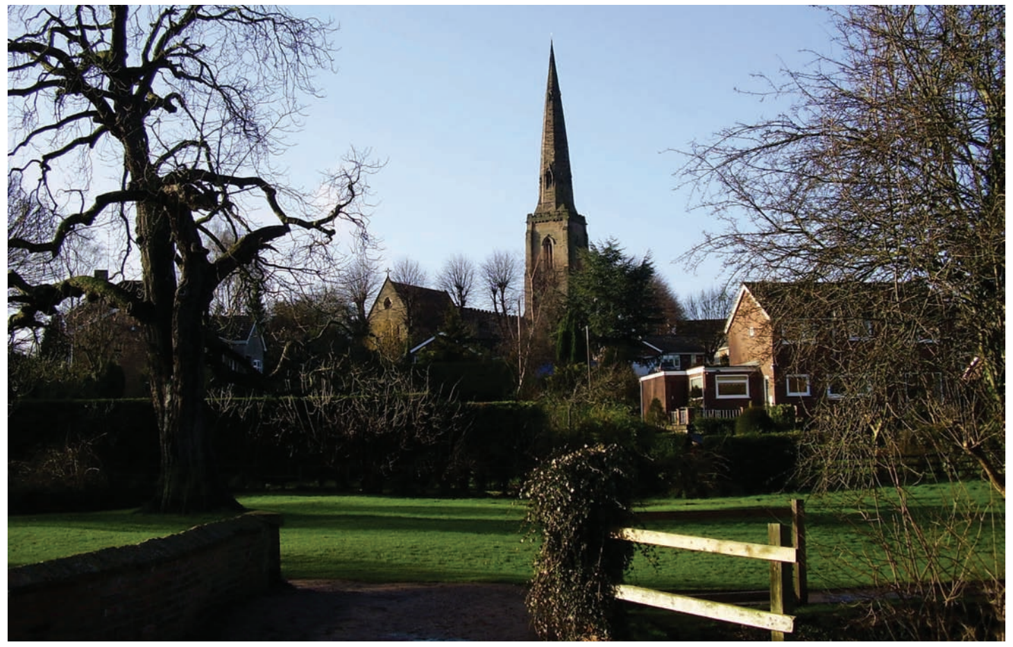
View across the bridge at Willow Park in the heart of Gedling