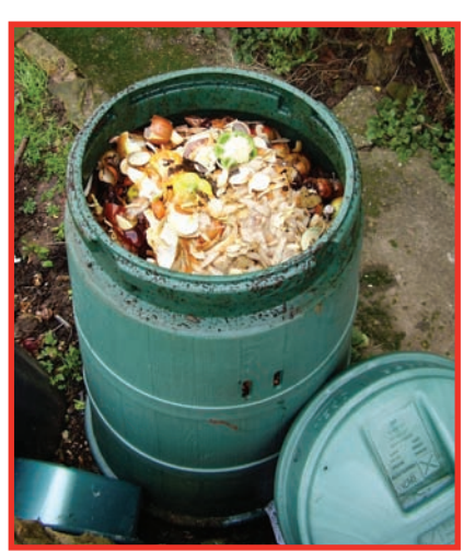
2,000 free composters

The environment is precious to us all, we believe that we all have a part to play in protecting and preserving it. As Labour Gedling Councillors we take our responsibilities seriously; increasing black bin collections was not part of our plans. Forward not back.